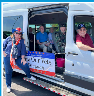
Harleysville's Annual Memorial Day Parade.