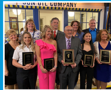
The 69th Annual Boyertown Citizen of the Year Gala.