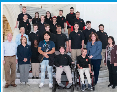
Souderton Area High School's Work Transition Program visits the Capitol.