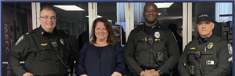
Upper Pottsgrove Township Police Department pancake breakfast