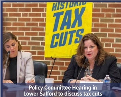
Policy Committee Hearing in Lower Salford to discuss tax cuts