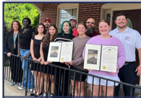
Souderton High School girls wrestling team