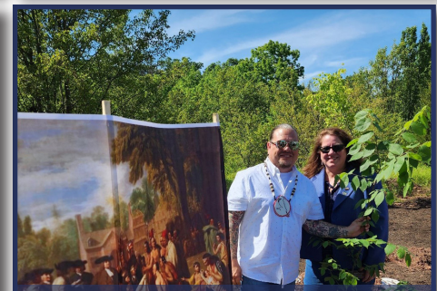
Perkiomen Valley Middle School East planting of NASA's Artemis Moon Tree