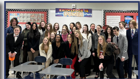
Meeting with the Boyertown Youth and Government Club