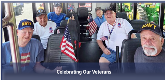
Celebrating Our Veterans

* This includes $280 million to help raise wages for the direct support professionals who care for Pennsylvanians and $74.8 million to begin the process of clearing the emergency wait list entirely, ensuring more Pennsylvanians receive the care they need and deserve.