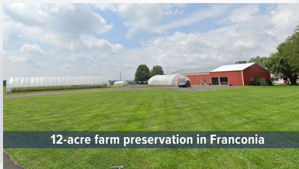
12-acre farm preservation in Franconia

With your concerns in mind, I proposed legislation which would amend the Open Space Act to make sure municipalities could not use preserved space for any new project, no matter the way or reason the municipality acquired the land. This legislation was introduced as House Bill 1734, but the language is currently being rewritten so it works for the entire Commonwealth and garners support from all House members. However, it is a crucial first step to expanding our protections for open space and preserved land in Pennsylvania. I will continue to listen to my constituents on every matter that is important to you, and if there is legislative action I can take on the issue, I will do so.