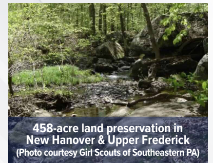
458-acre land preservation in New Hanover & Upper Frederick